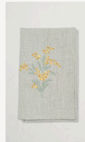
Embroidered Linen Towel