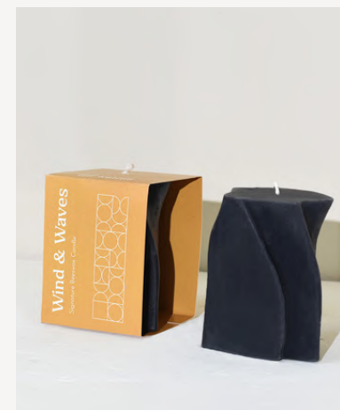
Wind & Waves Beeswax Candle - Charcoal