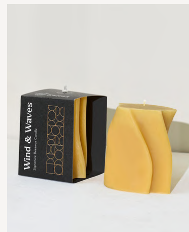
Wind & Waves Beeswax Candle - Yellow

The Wind & Waves candles are available individually or as a set, in natural yellow or charcoal black. Packaging can be personalized for corporate or event gifting starting at 50 pieces