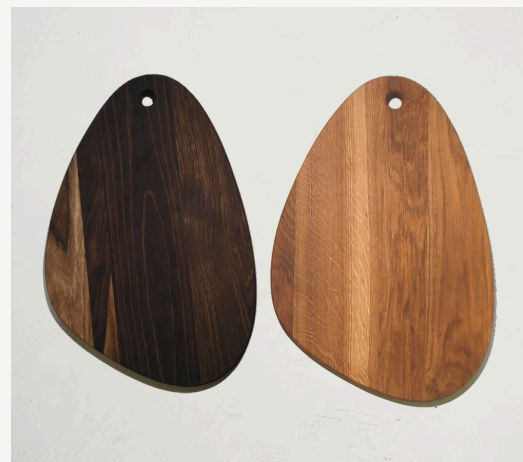
Artisanal Oak Cutting Board

Our wooden spatulas and cutting boards can be engraved with your company logo. Our linen kitchen towels can be embroidered with a custom design. Personalized gifting options start at 30 pieces.